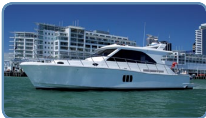
Activa 4800 Waterjet Express 52ft LOA 2010