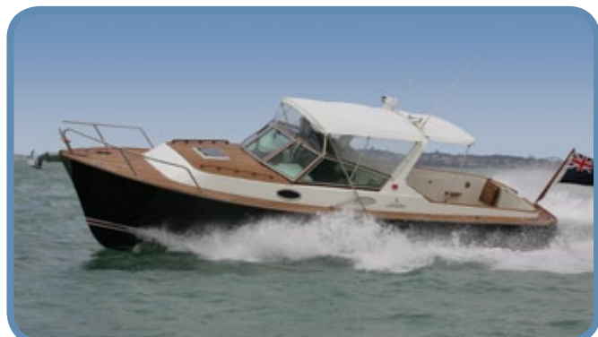
Nordic Star 3200 Waterjet picnic boat 32ft LOA 2007

MOTOR YACHTS WE HAVE HAD BUILT UNDER OUR DIRECT SUPERVISION: