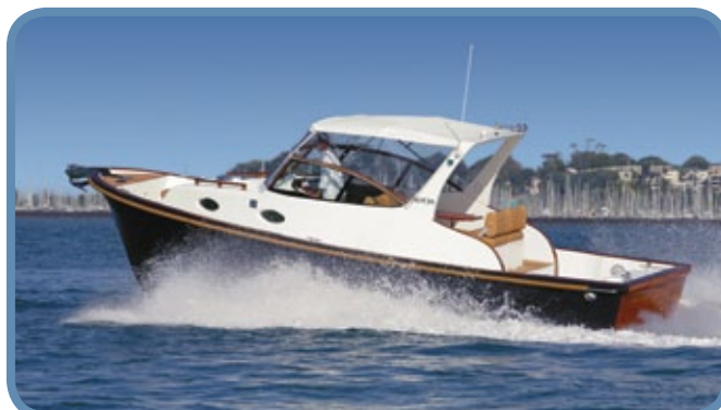
Activa 3300 Picnic Boat Cruiser 34ft LOA 2007