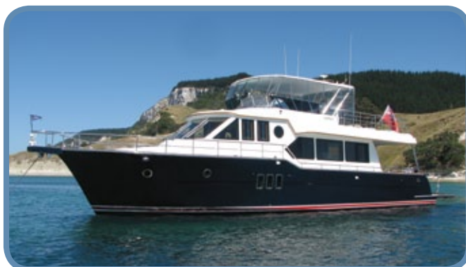
Activa 6400 Classic 70ft LOA 2008