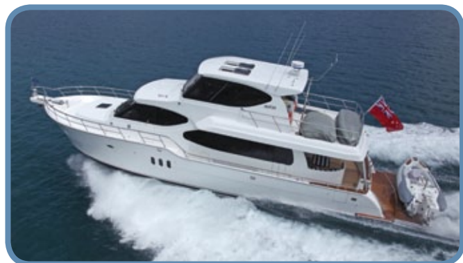
Activa 6400 Contemporary 70ft LOA 2009