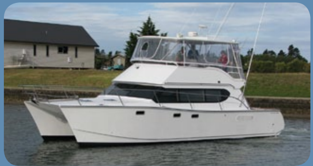
43ft Custom Powercat 2008-2010