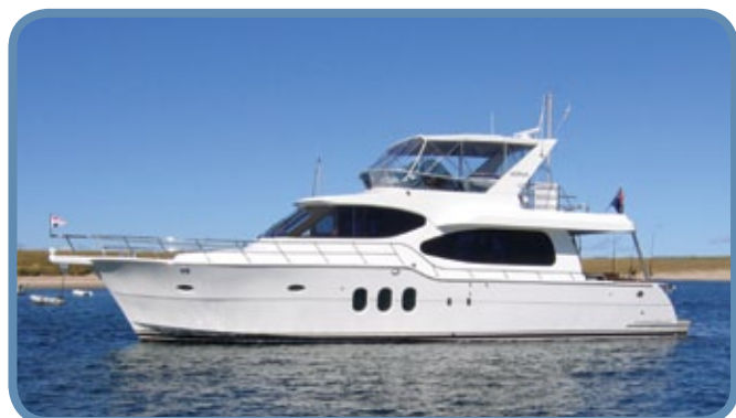
Activa 5800 58ft LOA 2007