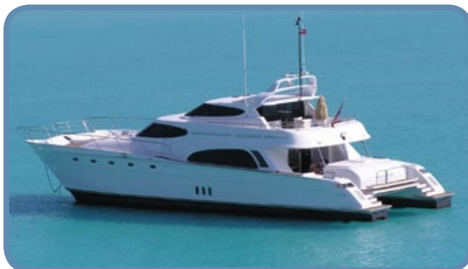
Pacific Harmony Custom Powercat 86ft LOA 2003-2005