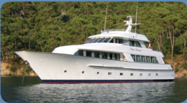
Pacific Mermaid 105ft Custom Superyacht 1996-present