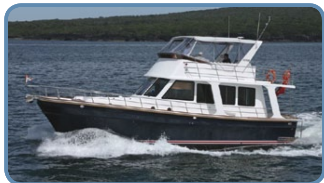
Activa 4500 Classic Cruiser 46ft LOA 2007