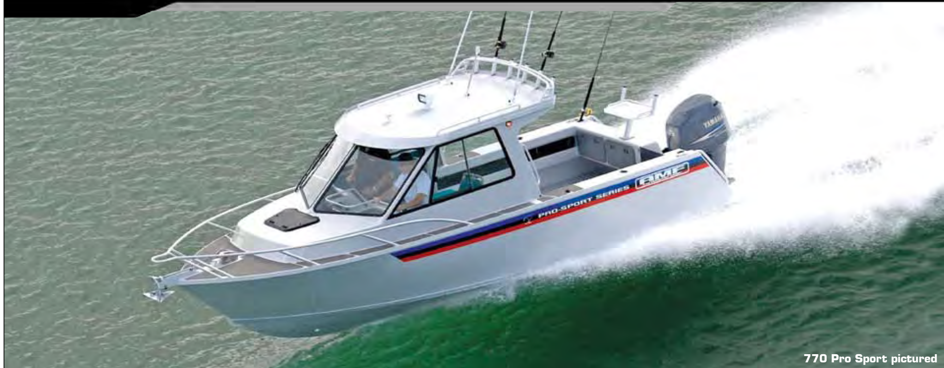
770 Pro Sport pictured