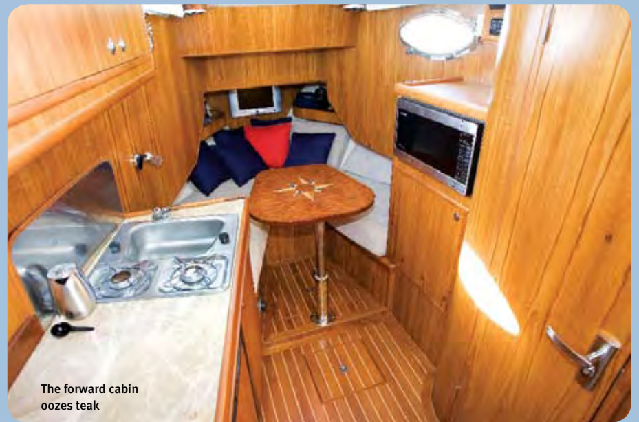
The forward cabin oozes teak