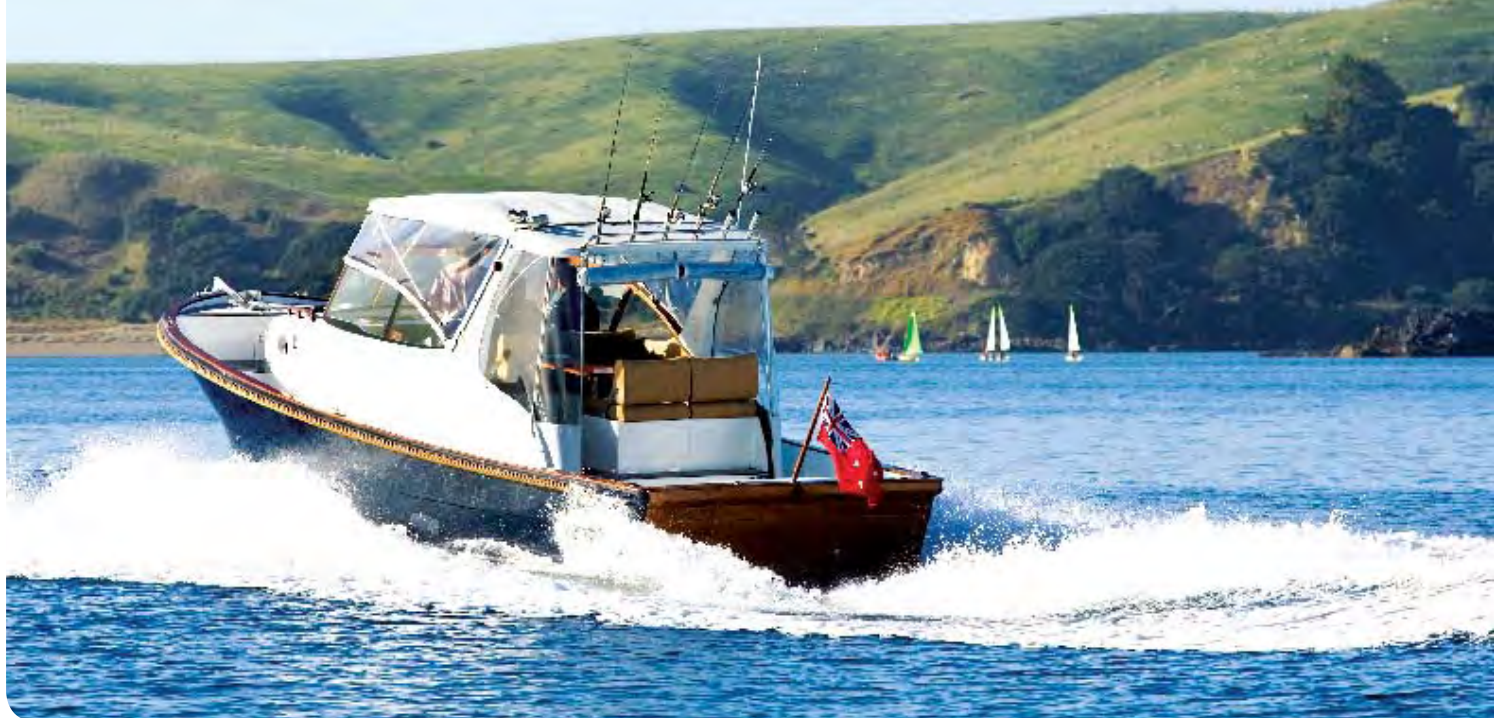
A gentlemen yacht finish with good detailing down below in the teak-lined forward cabin, accessed from the flybridge deck

For general sportfishing, the boat's layout is ideal. There are no annoying cockpit overhangs to interfere with casting and the