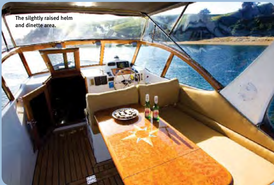
The slightly raised helm and dinette area.