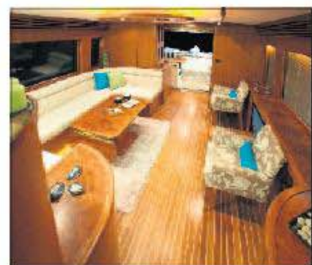
WELL-FITTED: The Activa's saloon exudes traditional luxury (above), seats eight people comfortably and has great flow to the cockpit.

Because the boat will be used for a variety of functions and styles of events, Winter's watchword throughout seems to have been "versatility". A good example is in the saloon where