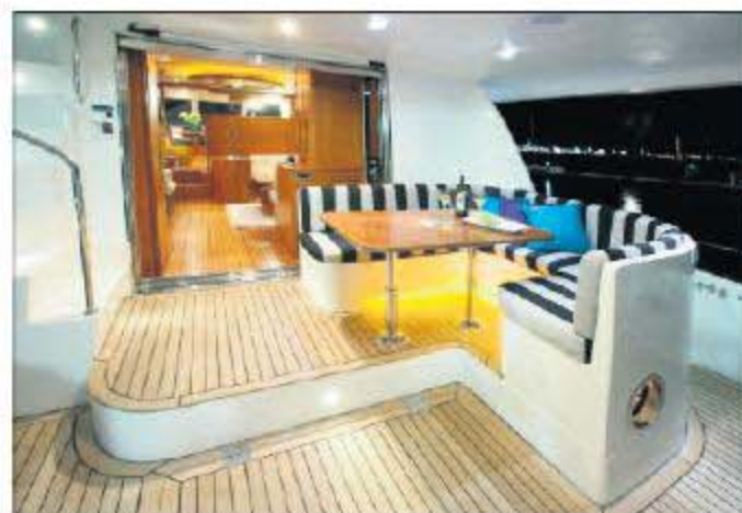
CLASSY: Designed by John Winter, the Activa (top) has a flybridge with a barbecue (left) and alfresco capacity (right).

Transom engine controls, including a remote for the bow thrusters, are positioned to make it easy to manoeuvre close to that ideal fishing, diving or picnic spot.